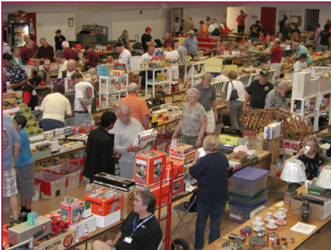
The 2012 GCMR Swap Meet was a rousing success. Read about it and see more photos inside.