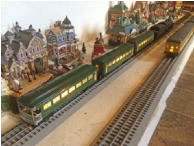
And on the lower level, one of my favorite early postwar passenger sets, from 1949 pulled by a #2026 before they “simplified” it in the 50’s.