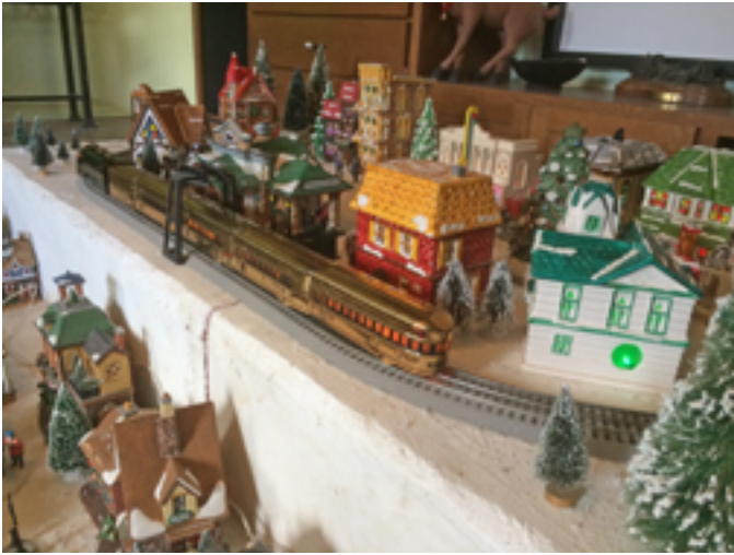
Here is the upper level with a Marx Mercury set.

When I still had my prewar train collection, I would run a prewar set on the upper loop and postwar on the bottom. This year it was a Marx theme on the upper level and postwar cataloged sets on the lower level. Sometimes I would just put together sets for miscellaneous postwar locos and cars.