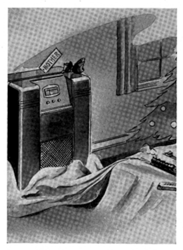
To unveil the big family gift of the day, rig the wrapping so that the switcher can run up to it, hook on, and pull the wrapping right off.

In addition to the classifieds, Lionel always offered suggestions as how to increase the "fun" of your trains. This is from an article on how to place a layout around your Christmas tree, featuring all the new goodies you were getting. But to hide them from the kids, you were to cover them with a sheet. Then on Christmas morning: