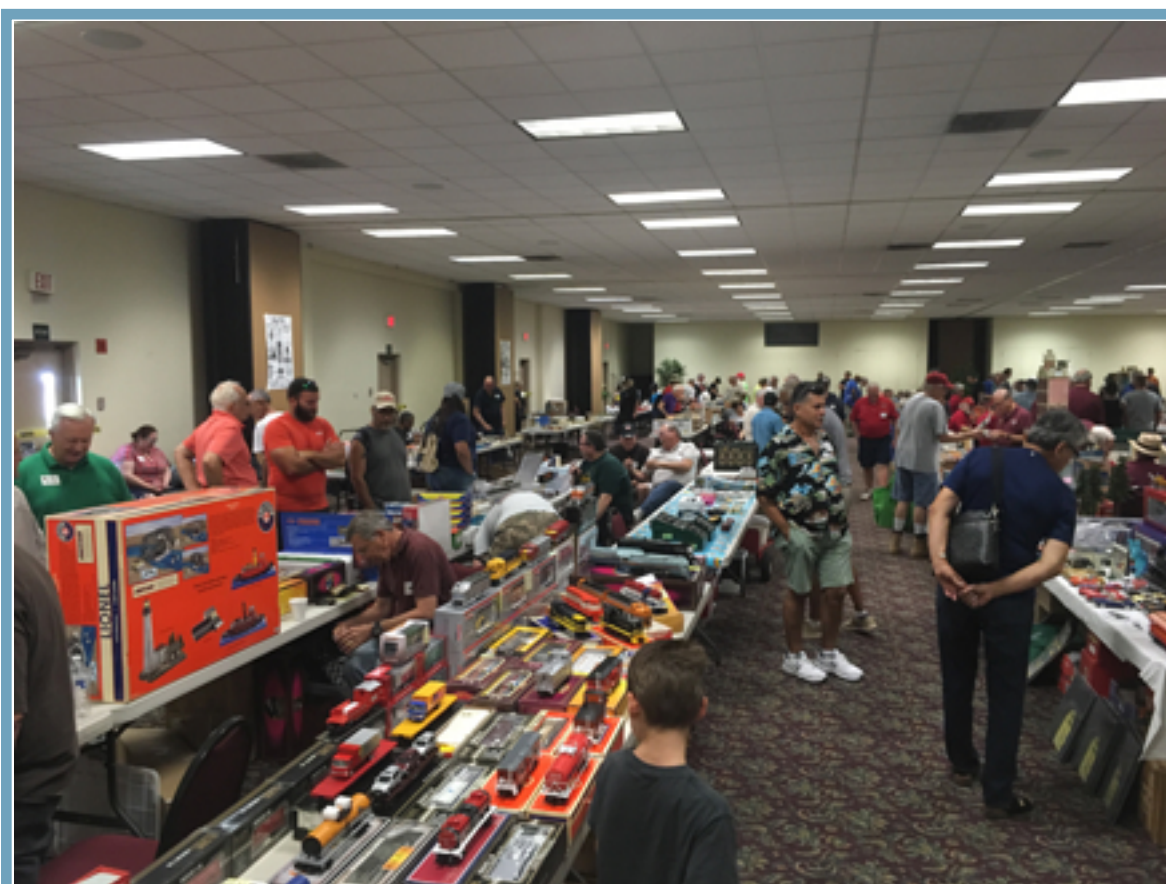
The 2017 Cactus Summer Meet is now history and what fun it was! All ran smoothly and the visitors had a great selection to choose from.