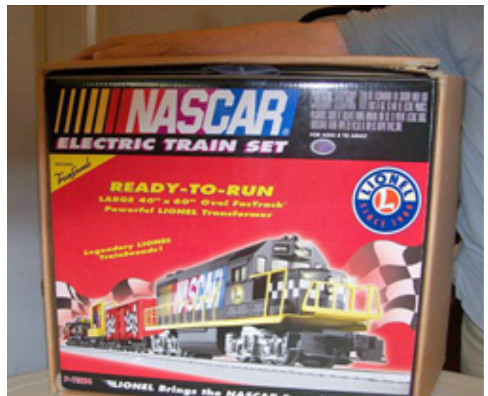
The raffle grand prize